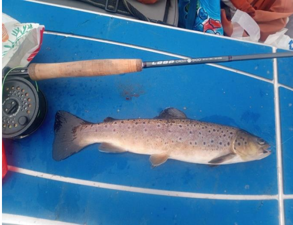
A fine tail on this Meig brownie in the last week of September